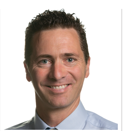
"We hadn't invested as much in North America in the past, because infrastructure tended to be less core and focused on energy"

"The European secondaries market has been a key element of the overall secondaries market over many