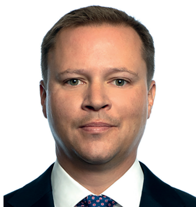
"The European secondaries market has been a key element of the overall secondaries market over many years"

Greene says Stafford's "slant towards core" has meant Europe has always formed the largest geographical area of its focus. "We hadn't invested as much in North America